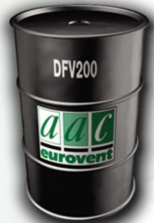
AAC DFV200 - Drum Filter Vessel

The AAC DFV200 Drum Filter Vessel can be installed in series for longer contact and higher efficiencies.