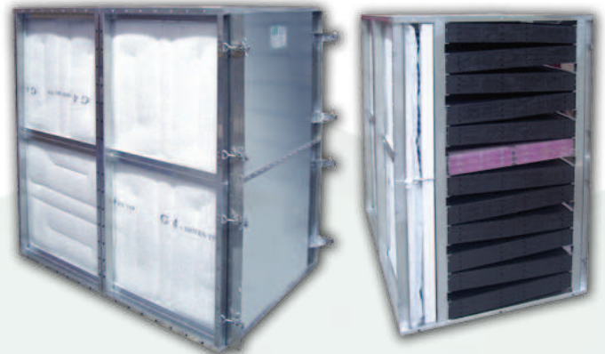
AAC Swiftpack® System